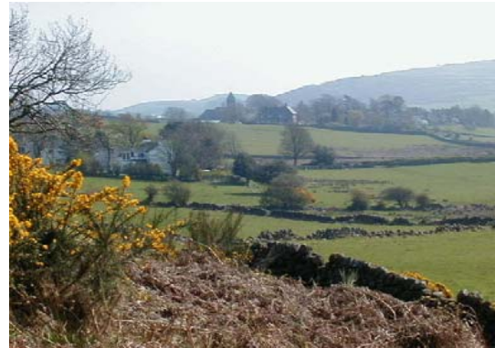
Kirkfield House and church from Grennan Hill