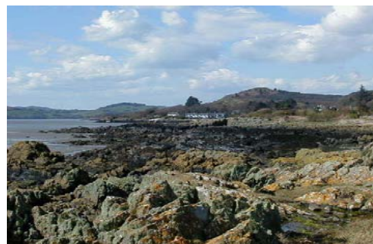
Rockcliffe from coastal path near Castlehill Point