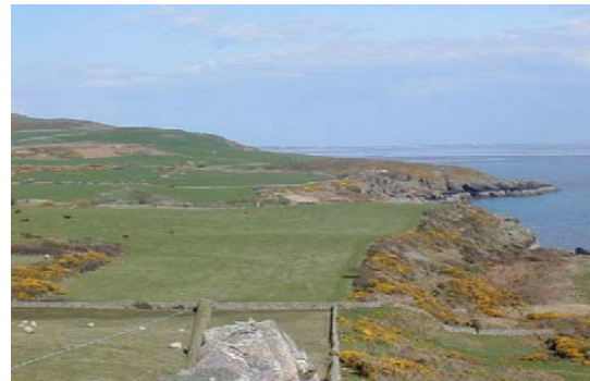
Gutcher's Isle from coastal path